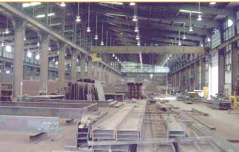
Steel Fabricating Shop, Leetsdale, PA

Whether working with a client on the build-out of an existing facility or the design of a new one, consideration is given to future expansion as well as immediate space needs. Land and buildings are typically designed to permit future expansion and layout changes with a minimum of inconvenience to the occupant.