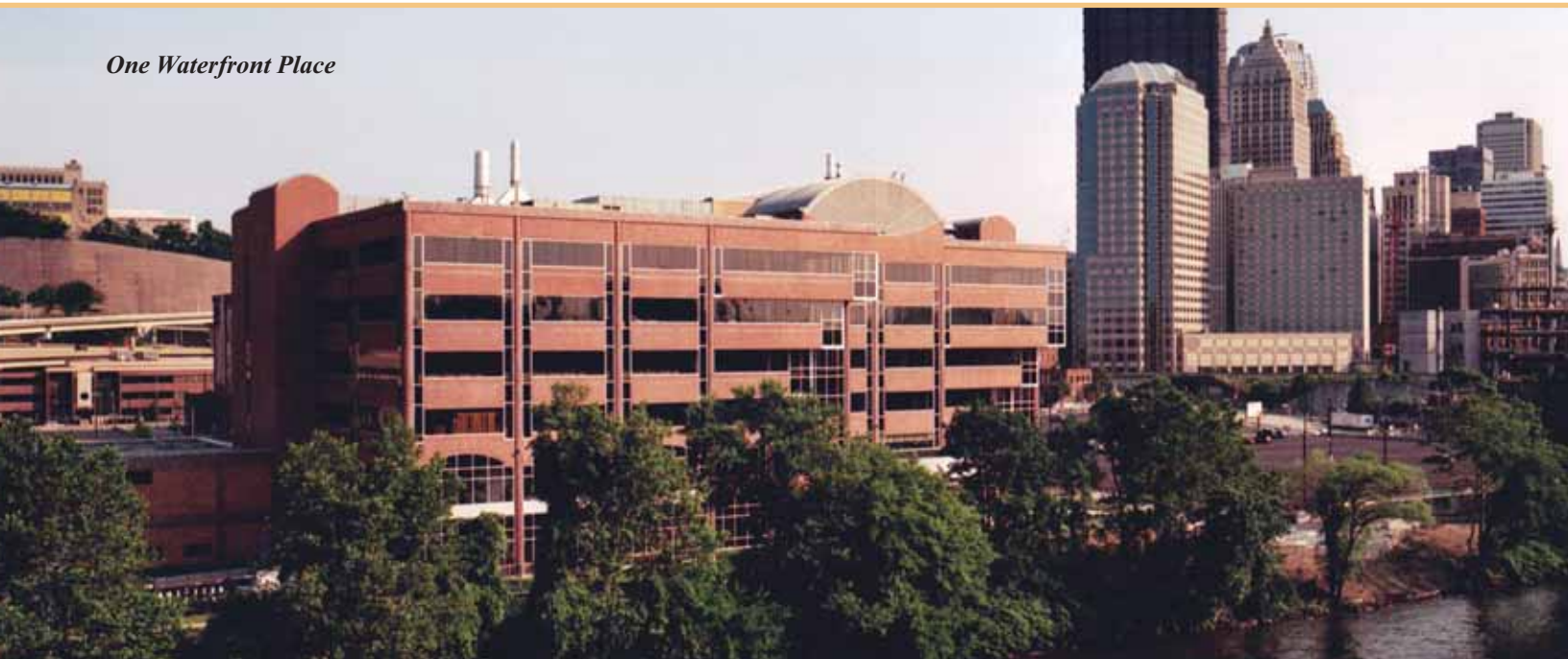
One Waterfront Place