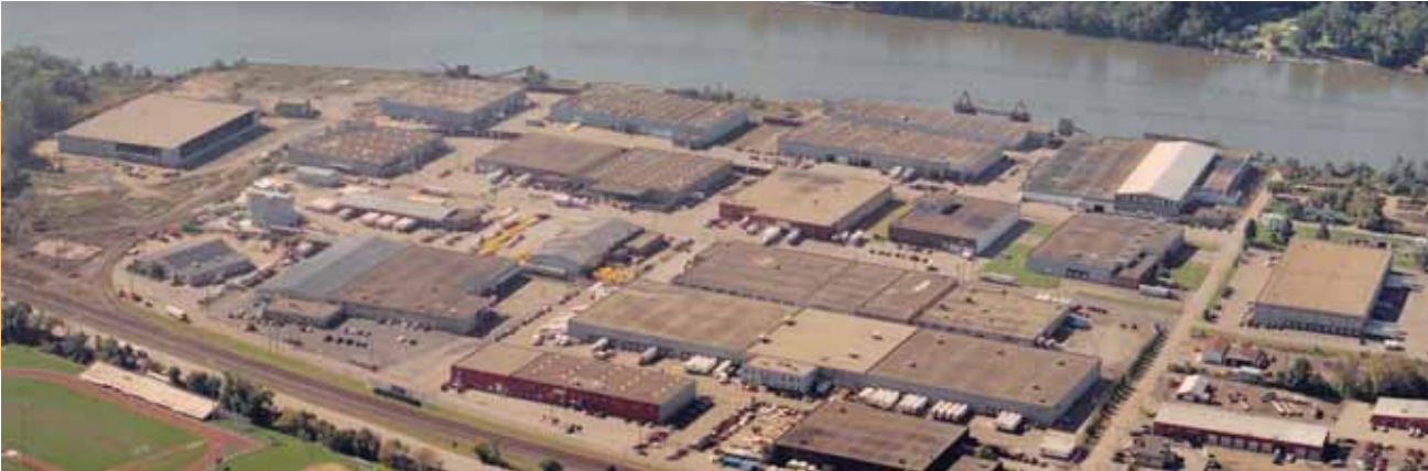
Leetsdale Commerce Park, Present

Group, LLC was established to develop and operate Hidden Valley Resort and The Hampton Inn and Suites Pittsburgh - Downtown. Buncher Resort Development Group, LLC was created to develop and market residential property surrounding the ski and golf amenities at Hidden Valley Resort, as well as other communities in Western Pennsylvania.