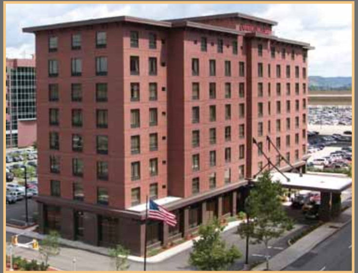
Hampton Inn & Suites Pittsburgh - Downtown

The success of The Buncher Company is founded on a reputation of proven ability and integrity. We are dedicated to providing high-quality products and services in all segments of our businesses as well as offering creative and flexible responses to our clients' needs.