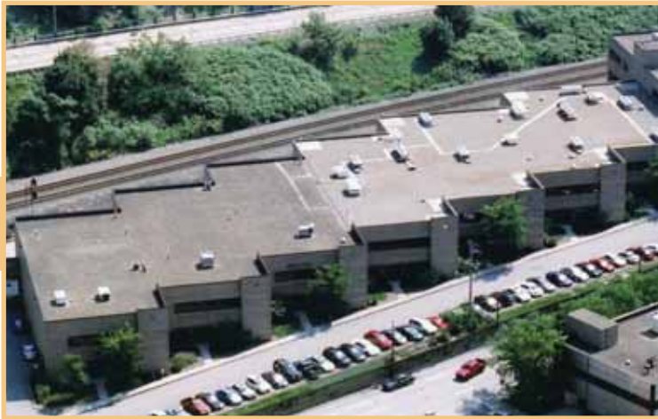
Liberty Tech Center

Since The Buncher Company builds, leases, and maintains only its own properties, our clients deal with just one entity. We are with each client for the long-term, creating incentives to maintain our business relationships to the mutual benefit of all parties.