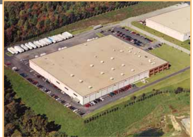
Tri-County Commerce Park

The Buncher Company warehouses its own steel inventory and maintains a comprehensive fabricating shop at the Buncher Commerce Park in Leetsdale, Pennsylvania. The stocking of standardized building frames enables the accelerated completion of the project. This capability both expedites construction time and results in cost-savings that are reflected in very competitive lease rates.