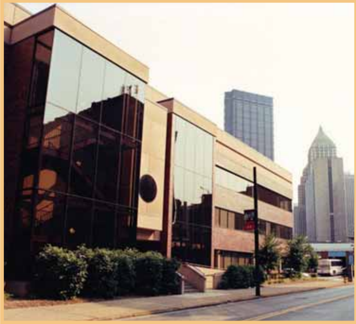
Penn Liberty Plaza I

As The Buncher Company has evolved, it has added to its full-service capabilities by forming divisions to develop and manage hospitality and residential real estate. Buncher Resort & Hospitality