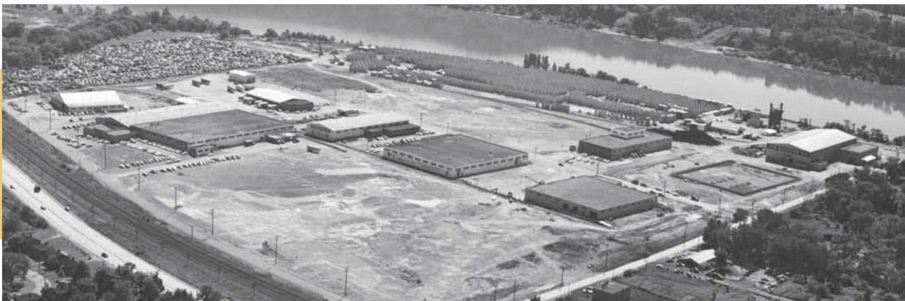
Leetsdale Commerce Park, 1959

metals trading. The Buncher Company's most significant endeavor was and continues to be in the development of industrial and commercial real estate, where it was the first to establish an industrial park in the Pittsburgh region. Since 1954, it has been a prominent investor and developer of high-quality office, distribution, flex, and light-manufacturing facilities for lease. Its list of tenants comes from a wide variety of industries including food service, high-tech, engineering, transportation, banking, and communications, along with various governmental agencies. Tenants range from startup organizations to Fortune 500 Companies.